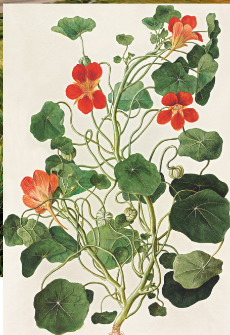
Cover image Bauer brothers, Hortus Botanicus, detail from "Tropaeolum majus", 1779